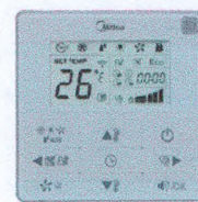
Wired Controller KJR29B (optional)