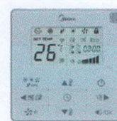
Wired Controller KJR29B (optional)